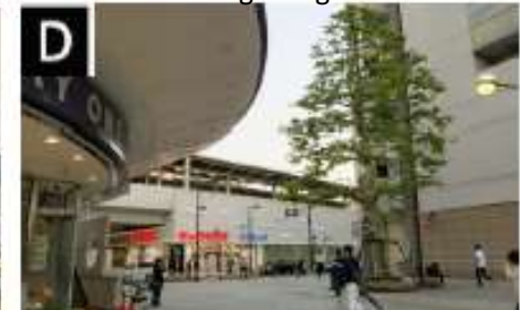
D Once you come up to the Bic Camera, turn right