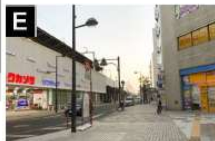
E After walking straight for approximately 50 meters, you will arrive at the bus stop.