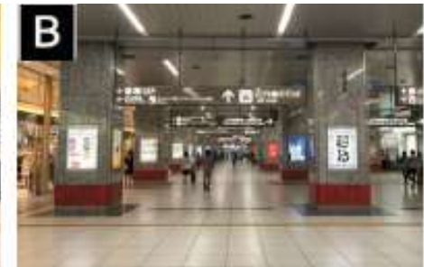
B Without going down the stairs that are just before the North Exit, continue walking straight forward.