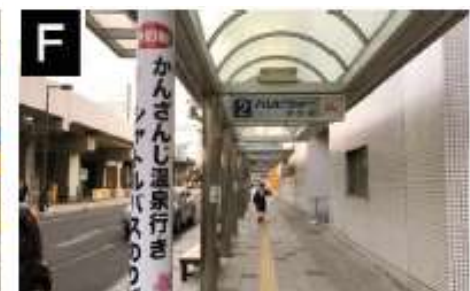
F Please wait at either the Number 2 or Number 3 gate to ride the shuttle bus.

Reservations and Inquiries : +81-50-3786-1144