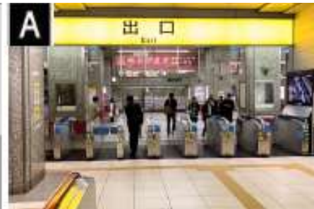
A After exiting the Shinkansen ticket gate, turn right and head towards Hamamatsu Station North Exit.