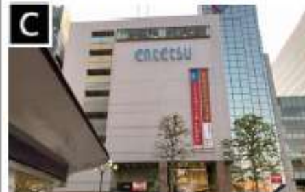
C After exiting the North Exit, turn left past the Entetsu Department Store that is next door.